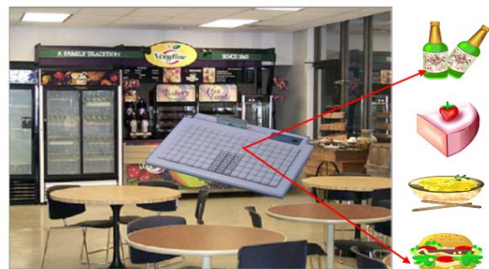
Each key is available for programming in application of POS system